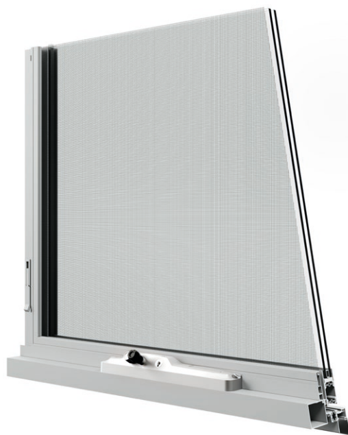
Aluminium screen fixed internally, with sash fasteners