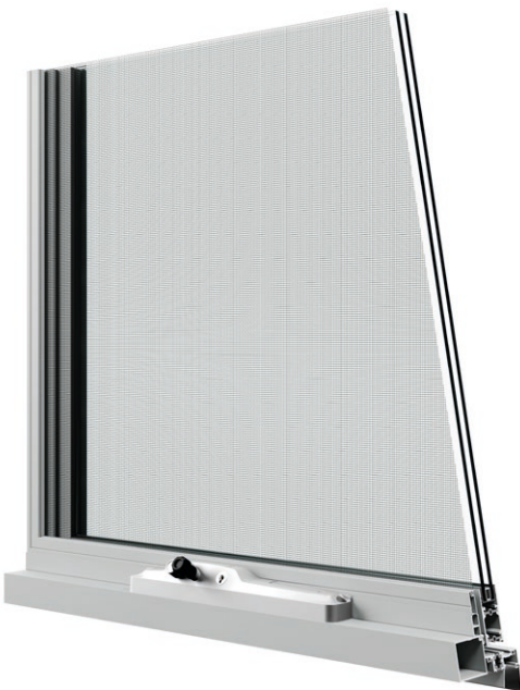
Aluminium screen fixed internally