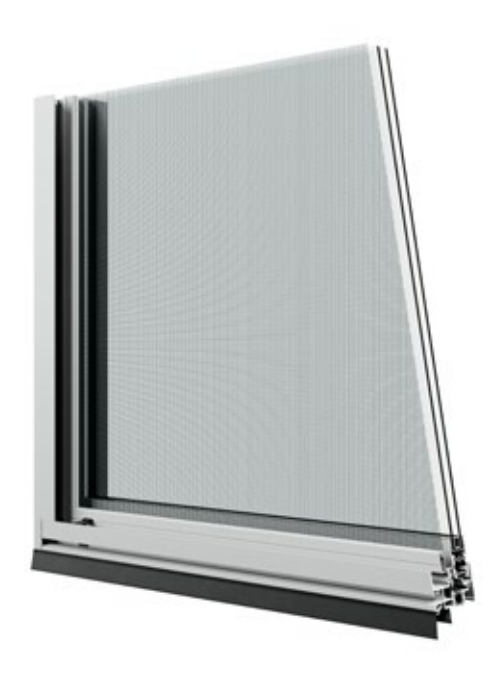
Aluminium screen fixed externally